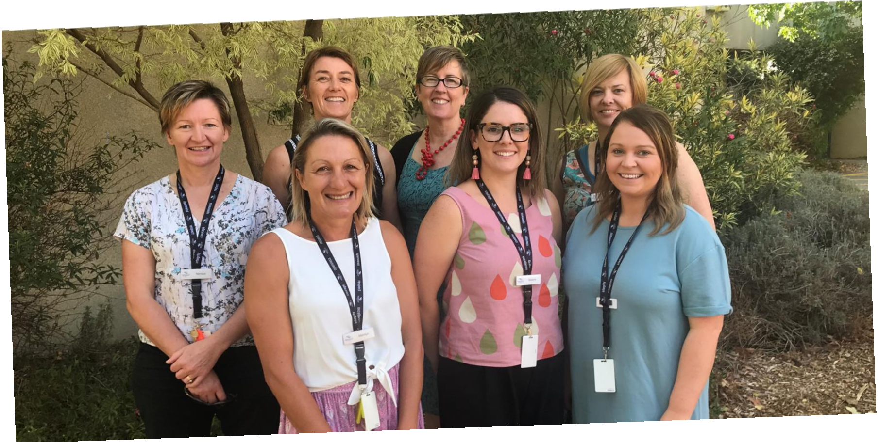
Morningside Peninsula Shire