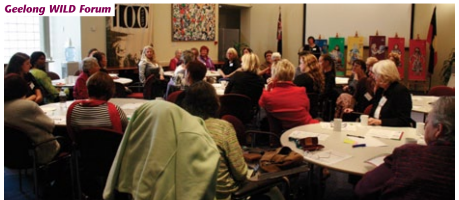
Geelong WILD Forum

Gathering strength by doing it together – endorsement of the Women's Charter. By setting a rolling order in which the six individual Councils would consider adoption of the Charter they were able to focus initially on the more supportive Councils as a way of showing what was possible.