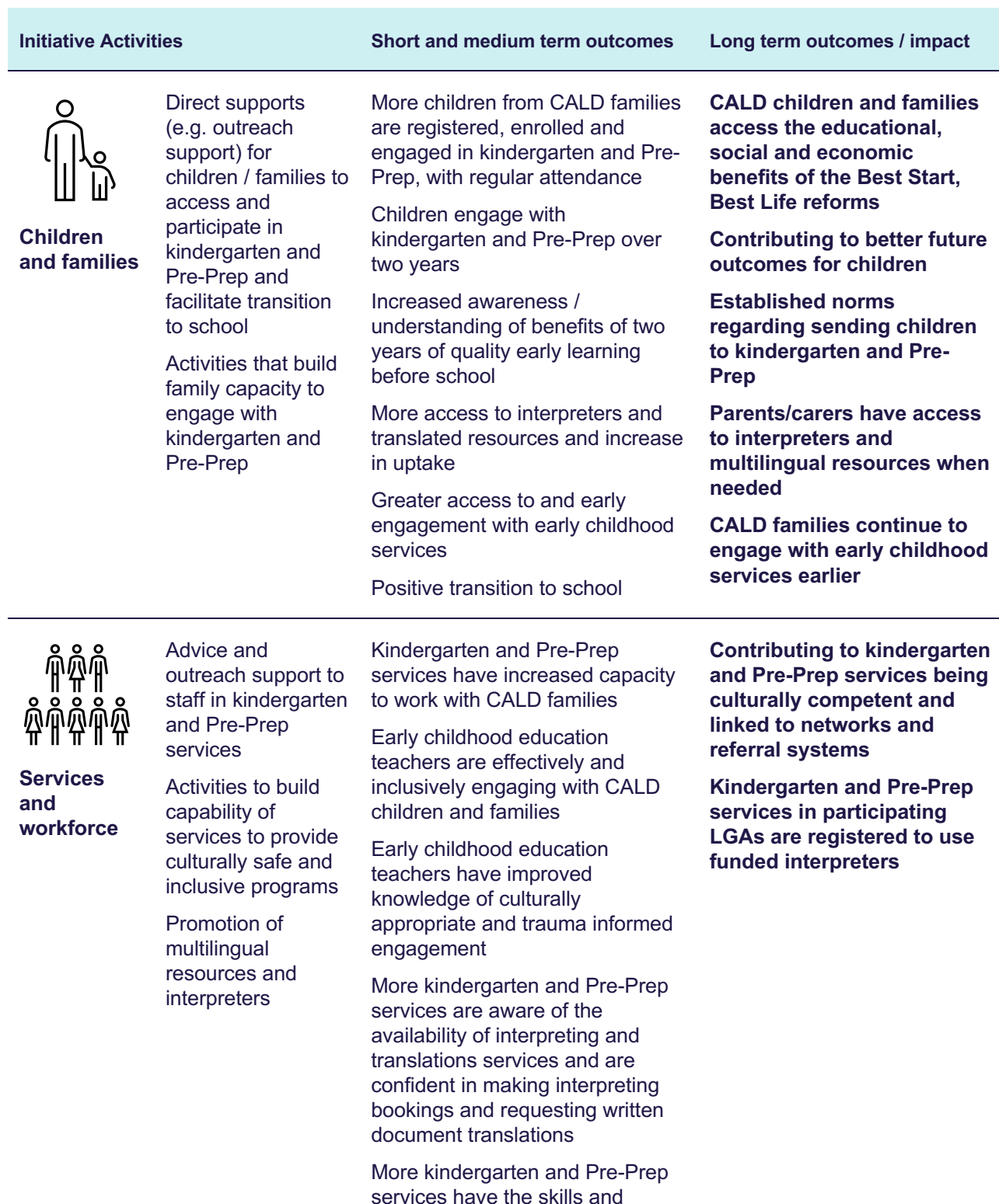
Table 1: CALD Outreach Initiative intended outcomes

The outcomes intended to be delivered through the Initiative's activities are outlined in Table 1 below.